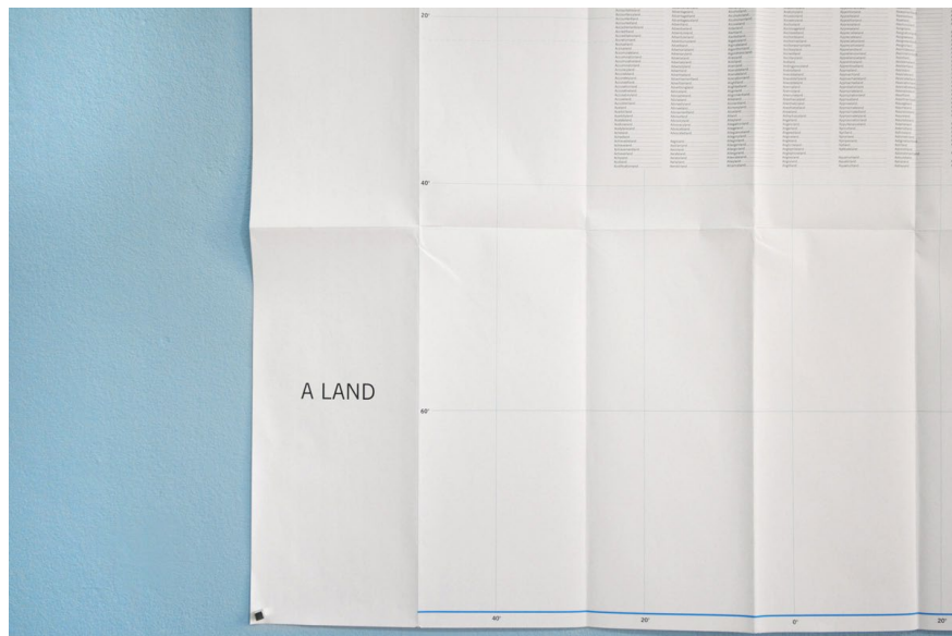
Elsa Werth A Land , detail