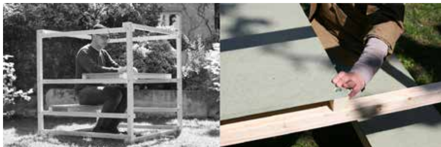
HGMC Table/Desk after the manual by Ken Isaacs.