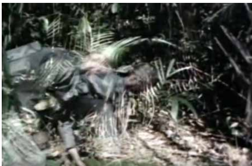
Still of the video Compilation II .