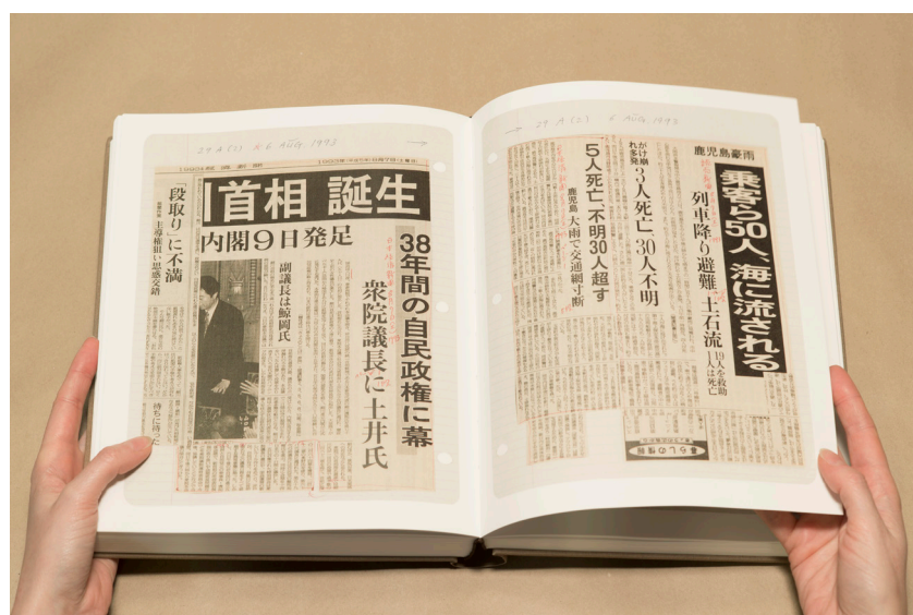
On Kawara, I READ , 2017