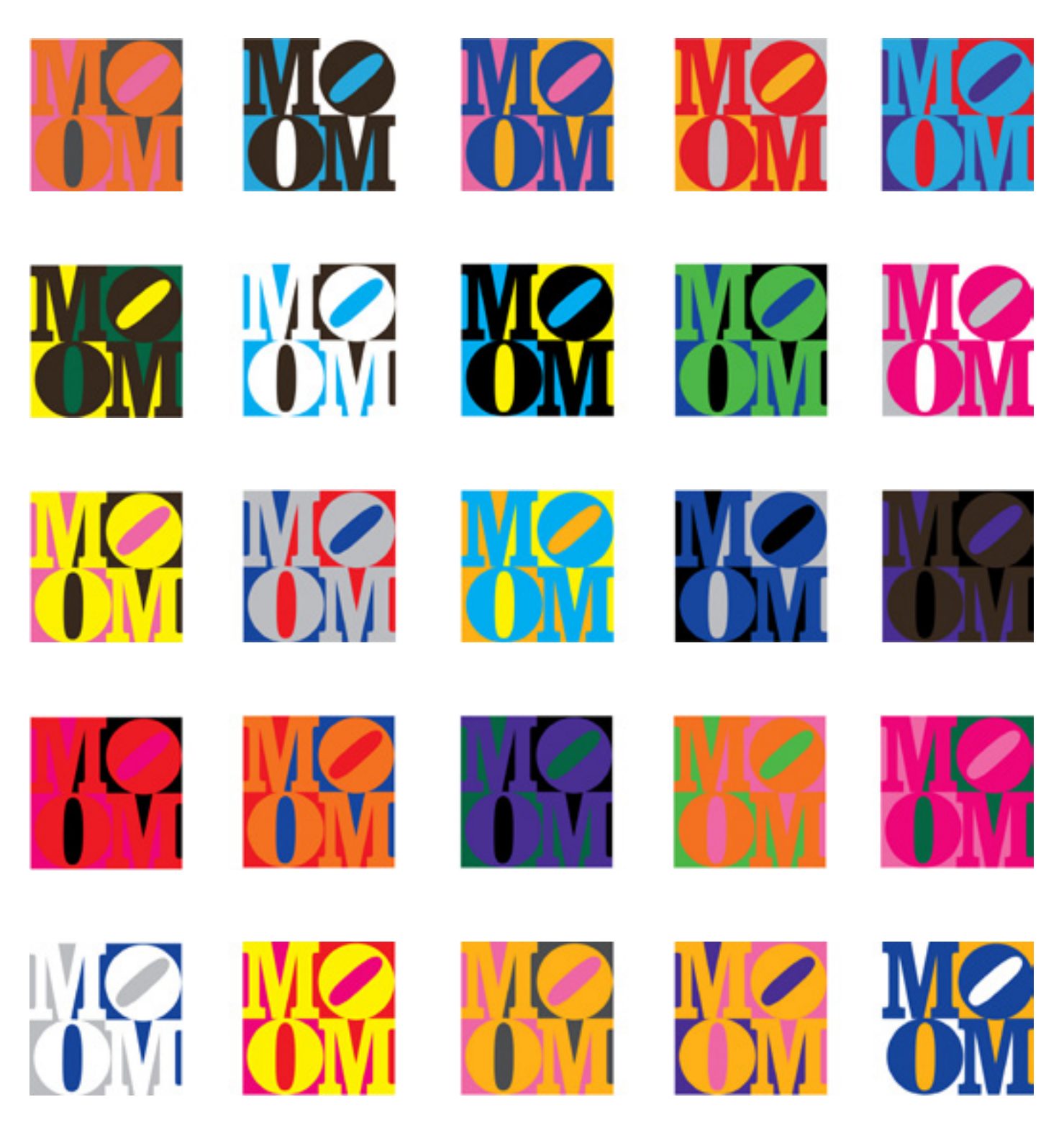
Romaric Tisserand 3360 TIMES (from M to 0) (from the top:) n^{\circ} 002 / 672, n^{\circ} 103 / 672, n^{\circ} 118 / 672, n^{\circ} 213 / 672, n^{\circ} 231 / 672 Sets consisting of 5 digital files Unique edition 1/1 + 1 AP Dimension of the materialized set: 5 times 40 cm x 40 cm 2014

A common idea connects both projects: the unity that is used as a module to be multiplied and combined. In Romaric Tisserand's case, the unity is the one created by the color. As for alban le henry, the unity in his installations arises from the stacking of the storage units.