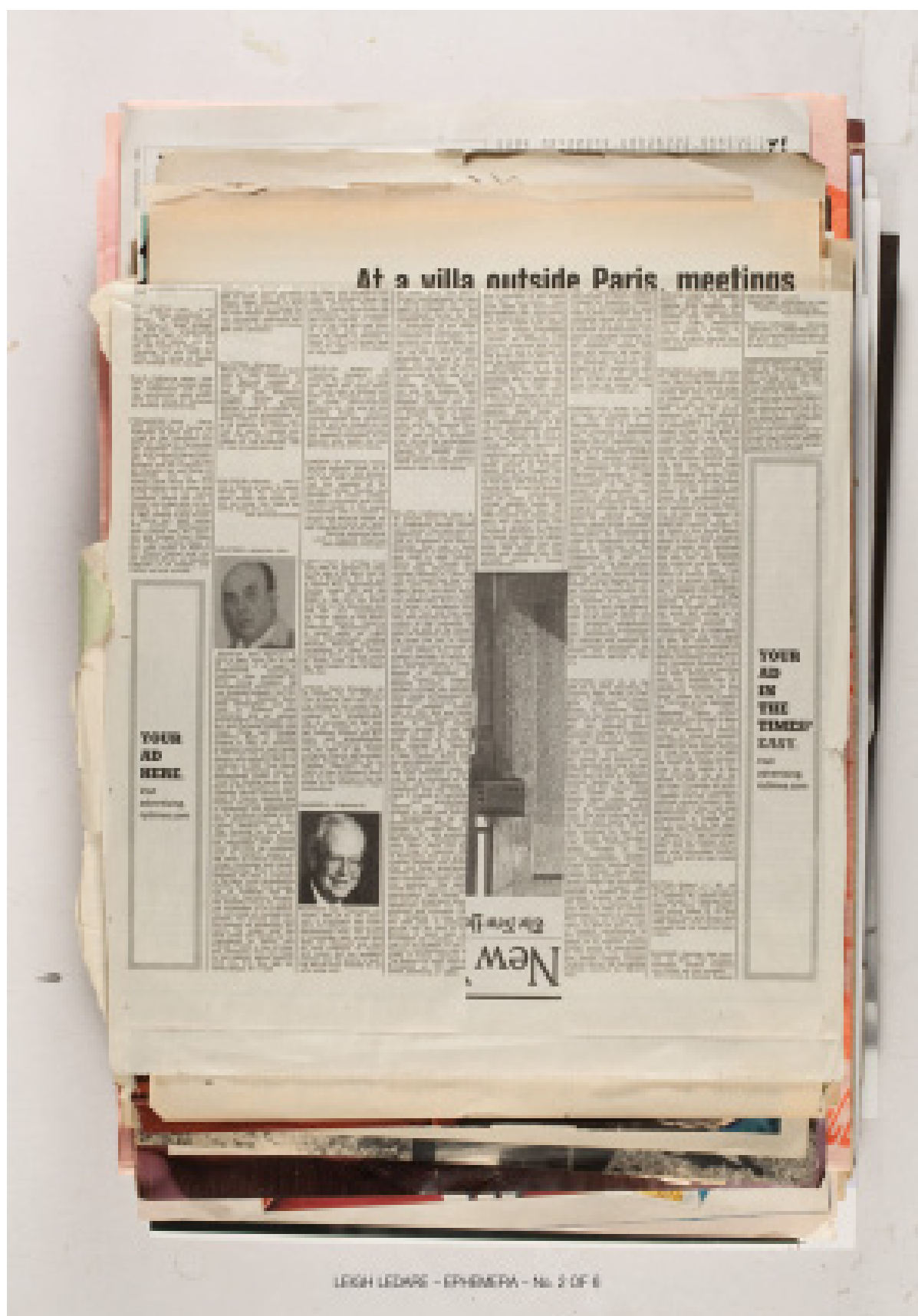
Ephemeras, volume 3 of 3