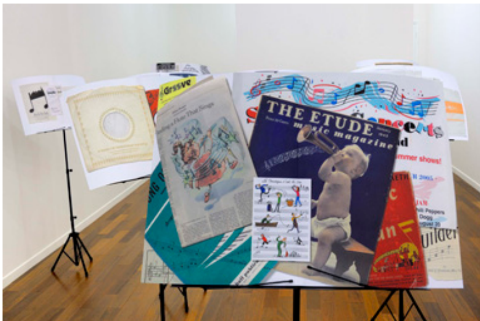
Christian Marclay, Ephemera