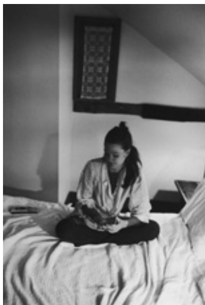
Leigh LEDARE, Double Bind Husbands , vol. 1 of 3, 21.6 x 27.9 cm, 96 pages, limited edition of 85 sets of 3 volumes and 15 A.P., certificate signed and numbered by the artist Produced and published in 2012 by mfc-michèle didier ©2012 Leigh Ledare and mfc-michèle didier