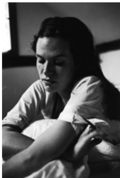
Leigh LEDARE, Double Bind Husbands , vol. 1 of 3, 21.6 x 27.9 cm, 96 pages, limited edition of 85 sets of 3 volumes and 15 A.P., certificate signed and numbered by the artist Produced and published in 2012 by mfc-michèle didier ©2012 Leigh Ledare and mfc-michèle didier