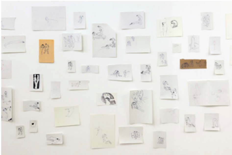
Annette Messager, Mes dessins secrets, Mon guide du tricot, Ma collection de champignons bons et champignons mortels