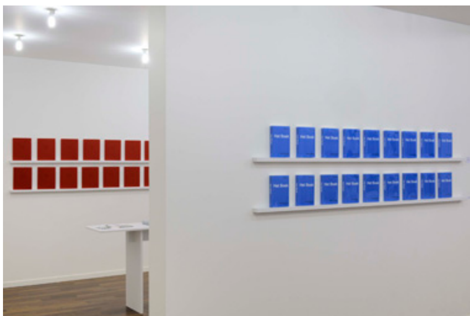
Regard sur nos productions, Part I and Part II