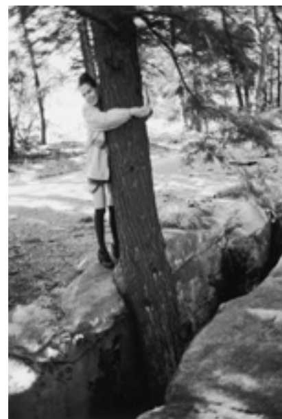
Leigh LEDARE, Double Bind Husbands , vol. 1 of 3, 21.6 x 27.9 cm, 96 pages, limited edition of 85 sets of 3 volumes and 15 A.P., certificate signed and numbered by the artist Produced and published in 2012 by mfc-michèle didier ©2012 Leigh Ledare and mfc-michèle didier