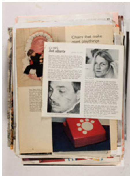
Leigh LEDARE, Double Bind Ephemeris , vol 3 of 3, 30.9 x 41.3 cm, 480 pages, 6 revues, 80 pages each, limited edition of 85 sets of 3 volumes and 15 A.P., certificate signed and numbered by the artist Produced and published in 2012 by mfc-michèle didier ©2012 Leigh Ledare and mfc-michèle didier