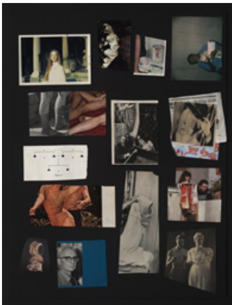
Leigh LEDARE, Double Bind Diptychs , vol. 2 of 3, 30 x 38,3 cm, 112 pages, limited edition of 85 sets of 3 volumes and 15 A.P., certificate signed and numbered by the artist Produced and published in 2012 by mfc-michèle didier ©2012 Leigh Ledare and mfc-michèle didier