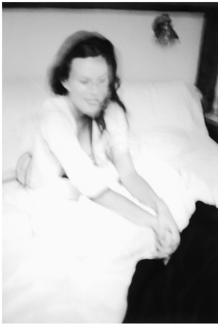
Leigh LEDARE, Double Bind Husbands , vol. 1 of 3, 21.6 x 27.9 cm, 96 pages, limited edition of 85 sets of 3 volumes and 15 A.P., certificate signed and numbered by the artist Produced and published in 2012 by mfc-michèle didier ©2012 Leigh Ledare and mfc-michèle didier