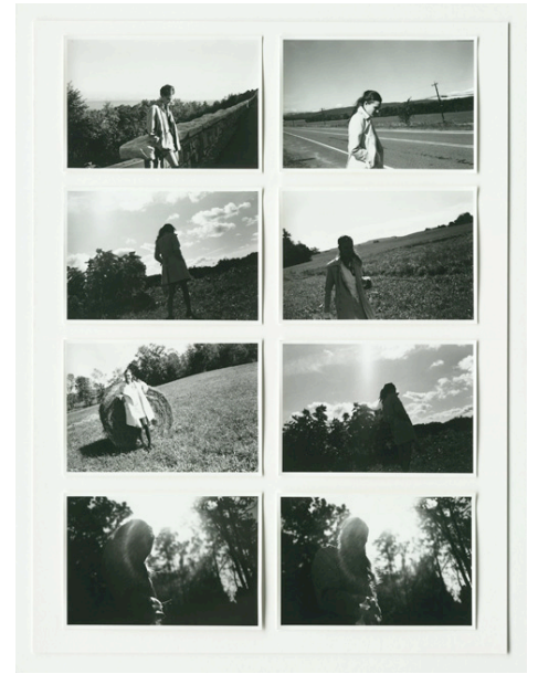
Leigh LEDARE, Double Bind Diptychs , vol. 2 of 3, 30 x 38,3 cm, 112 pages, limited edition of 85 sets of 3 volumes and 15 A.P., certificate signed and numbered by the artist Produced and published in 2012 by mfc-michèle didier ©2012 Leigh Ledare and mfc-michèle didier