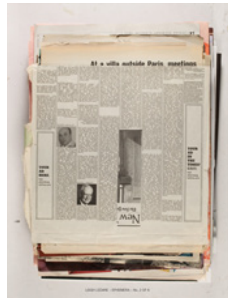
Leigh LEDARE, Double Bind Ephemeris , vol 3 of 3, 30.9 x 41.3 cm, 480 pages, 6 revues, 80 pages each, limited edition of 85 sets of 3 volumes and 15 A.P., certificate signed and numbered by the artist Produced and published in 2012 by mfc-michèle didier ©2012 Leigh Ledare and mfc-michèle didier