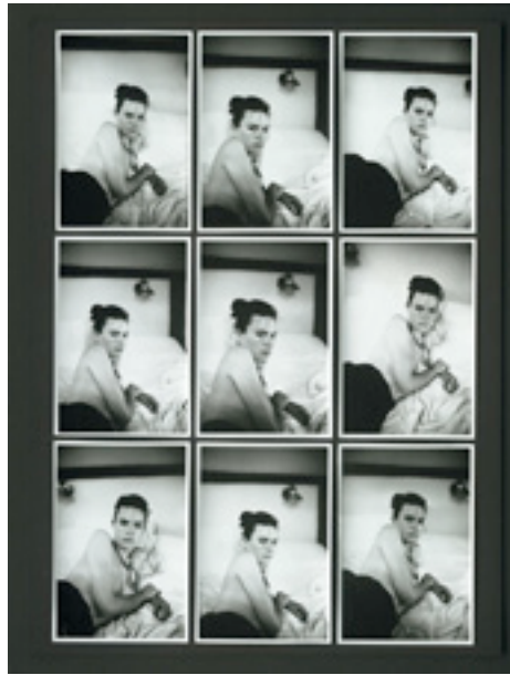
Leigh LEDARE, Double Bind Diptychs , vol. 2 of 3, 30 x 38,3 cm, 112 pages, limited edition of 85 sets of 3 volumes and 15 A.P., certificate signed and numbered by the artist Produced and published in 2012 by mfc-michèle didier ©2012 Leigh Ledare and mfc-michèle didier