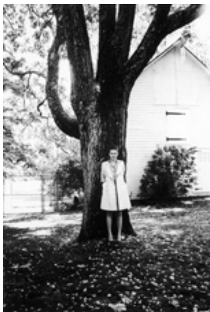
Leigh LEDARE, Double Bind Husbands , vol. 1 of 3, 21.6 x 27.9 cm, 96 pages, limited edition of 85 sets of 3 volumes and 15 A.P., certificate signed and numbered by the artist Produced and published in 2012 by mfc-michèle didier ©2012 Leigh Ledare and mfc-michèle didier