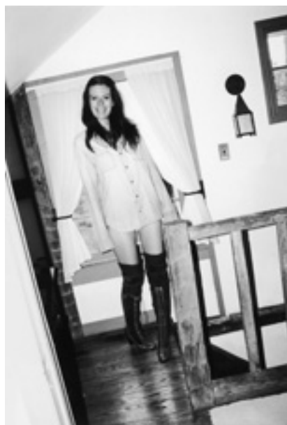
Leigh LEDARE, Double Bind Husbands , vol. 1 of 3, 21.6 x 27.9 cm, 96 pages, limited edition of 85 sets of 3 volumes and 15 A.P., certificate signed and numbered by the artist Produced and published in 2012 by mfc-michèle didier ©2012 Leigh Ledare and mfc-michèle didier