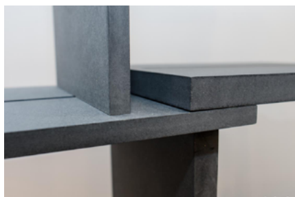
stack on display at mfc-michèle didier gallery in March-April 2014.