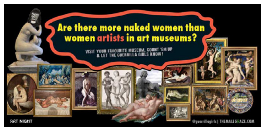
Are there more Naked Women than Women Artists in Art Museums, 2021